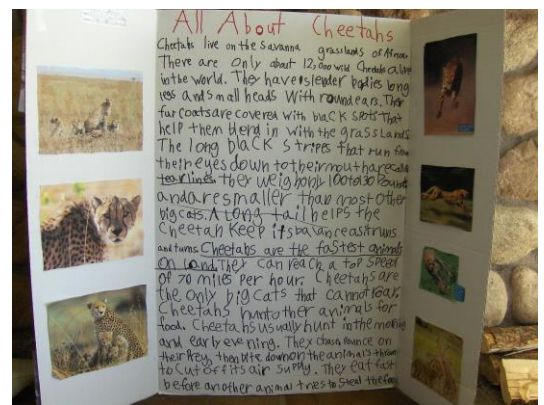
Completed by a 1<sup>st</sup> Grade Student