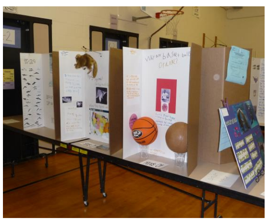
1st Grade Students