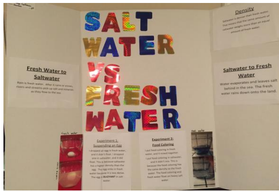
Completed by a 3rd Grade Student